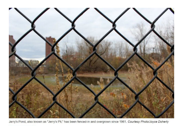
IQHQ, the owner of Jerry's Pit in North Cambridge, announced its intention to remediate and restore the land as open space for public use.

We're planning art-making activities, invasives wrangling, native garden weeding, a bit of cleanup, Audubon wildlife handling, entertainment by Bengali dancers, a honk band, and an ice cream truck! We'll have tabling with updates on IQHQ's reopening of the pond to public access, a proposed "EcoCenter," plans for Community Garden, and other great proposals.